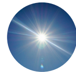
Ray of the sun