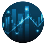
Business chart indicator