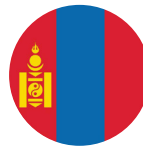
National flag of Mongolia