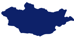
Map of Mongolia

This name is the essence of the brand. In implementing these concepts through the brand, we adhere to the principles of being better, simpler, and smarter.